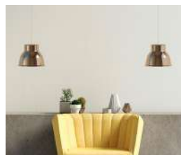
Living Home Interior