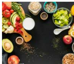
Premium Food and Beverage