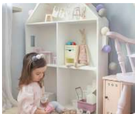
Baby / Kids