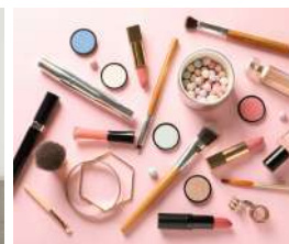
Beauty / Cosmetics Fashion / Accessories