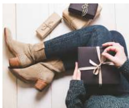
Sales Promotion Gift Items