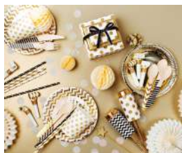
Kitchenware Home Appliance