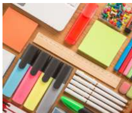
Stationery Office Supplies